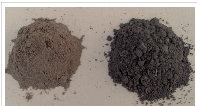
Fig. 1. Sandy soil (left) and black soil (right).

Field experiment. Cultivar: Xianyu 335. Density: 60000 plants/ha, Row spacing: 0.6 m; Seedling Distance: 0.28 m; Test plot area: 6 × 4 m = 24 m 2 . Nitrogen fertilizer: 120 kg/ha = basal fertilizer 60 kg/ha + large trump bell 60 kg/ha; 76 kg P 2 O 5 /ha; 100 kg K 2 O/ha. Experimental site: Fujiajie village of Sikeshu town, Lishu County, Jilin province of China. Treatments: Black soil and sandy soil. Both treatments were replicated three times. Soil types are shown in Figure 1.