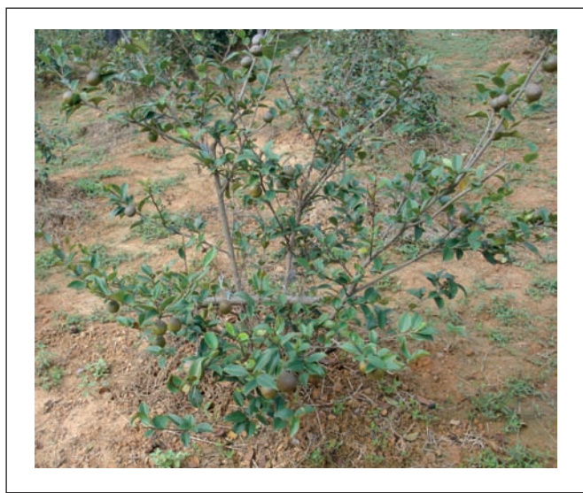
Fig. 1. Plant of Camellia oleifera .

Camellia , mainly distributed in south China, and a small amount distributed in South Asia, is a species with a production value of edible oil, which belongs to Camellia spp. of Theaceae. Camellia is a small evergreen tree or shrub, which is one of the world's four major woody oil plants together with olive, oil palm and coconut. The planting area of Camellia in China is about 400 million hm 2 , which accounts for more than 80% of our cultivation area of edible-oil woody species (Zhuang, 2008). Camellia oleifera , the most common Camellia species, is shown in Figure 1.