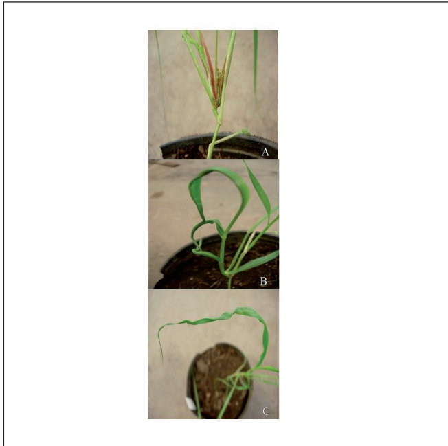
Table 2. Total number of selected plants grown from seeds of Cenchrus ciliaris L. cv Biloela, number of plants that exhibited polymorphism, and percentage variation observed using EMS or X-ray treatments.

Fig. 1 Variaciones fenotípicas observadas en plantas obtenidas a partir de semillas tratadas con rayos X. A: Hojas y entrenudos cortos formando una roseta apical. B: Morfología aberrante en hojas. C: Hojas enroscadas.